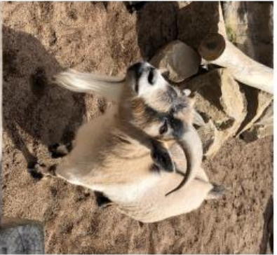
Littlefoot (M) #114023 DOB:5/9/14