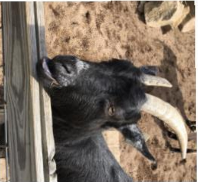
August (F) #114024 DOB: 5/08