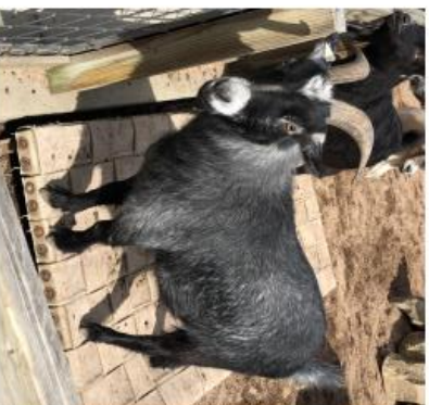
Petrie (M) #114020 DOB:4/19/14