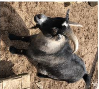
Sharpooth (M) #114021 DOB:4/20/14